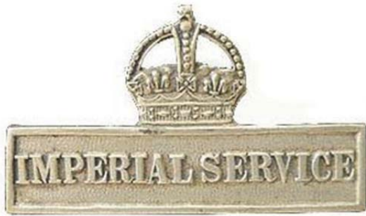
The Imperial Service Badge

As Territorials Laurence and Cecil had agreed to be available for home service only and so could not be posted overseas unless volunteering to do so, as volunteers both men could serve overseas but only in their own unit (i.e., they couldn't be transferred or posted to another Regiment).